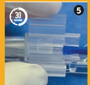
Wait for 30 seconds

The cartridge and the loading chamber both contain a coating that is activated when hydrated by the addition of BSS*. The coating fixes a layer of fluid that ensures lubrication. Full hydration of all the parts is mandatory.