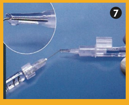
Apply a viscoelastic solution** through the tip of the cartridge to entirely fill the cartridge and the tunnel. The system is ready for injection (do not advance the lens into the tunnel).