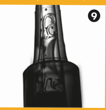
Check that the trailing haptics are not covering the optic. Then, insert the cartridge tip into the incision and slowly and continuously push the plunger until the lens is delivered. It is very important not to stooduring the pushing process.