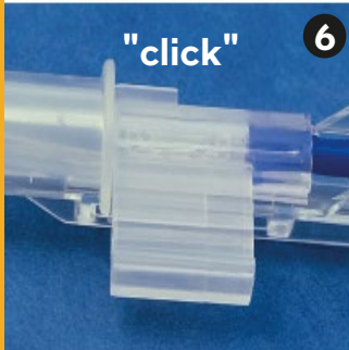
Close the wings of the cartridge until you hear a "click".