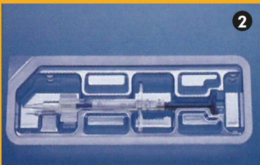
Open the blister and transfer the injection system onto the sterile field