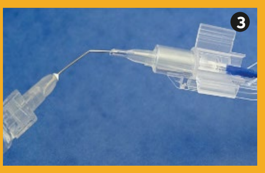
Rinse the lens by slowly injecting BSS* from the tip of the cartridge inclined upwards.